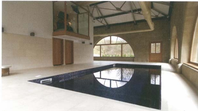
Above. Natural stone comes into its own for swimming pool surrounds and fitness areas. The pool and fitness area pictured here was created by Rockford in Middlewich, Cheshire, using honed Simena Turkish limestone.