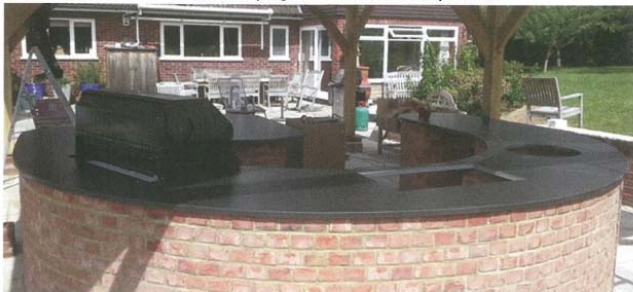
Below. Inside out. Kitchen worktops are making their way into the garden. The one pictured here was made from 30mm honed Nero Pretoria by Algarve Granite in Northamptonshire.