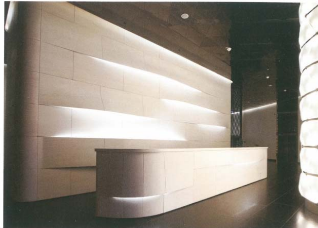
Above. There have been some spectacular feature walls erected in residential apartment blocks and commercial buildings lately thanks to the versatility of ever-evolving CNC machinery and an enthusiasm among architects for imaginative design. The 400m 2 wall and desk pictured above are made of Rosal CD limestone from Portuguese company Aire Marmores. They are at the International Business Center Federation Tower East in Moscow.