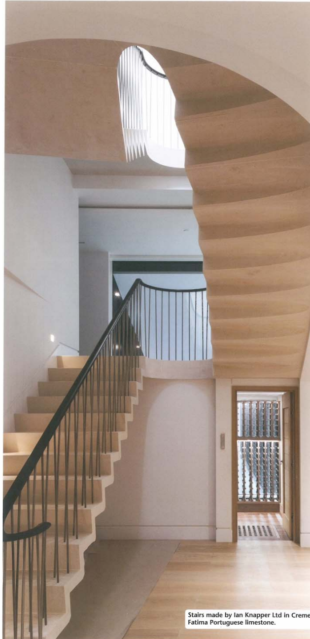
Stairs made by Ian Knapper Ltd in Creme Fatima Portuguese limestone.

Ian Knapper has just bought his first CNC machine, a five-axes GMM Egil from Roccia Machinery, to increase productivity. The shape of the steps can be quite complex and Ian is using Alphacam software to design