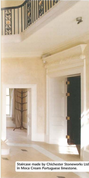
Staircase made by Chichester Stoneworks Ltd in Moca Cream Portuguese limestone.